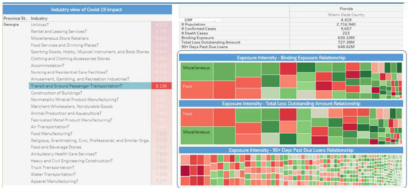
Figure 2. Industry Integrated View.

The view in Figure 2 is depicting the industry-wise classification, using CIRP, for the geography. Also, how the bank is exposed because of COVID-19 to a particular industry is displayed by considering selected risk metrics. This visualization will help in monitoring how industries are performing during an epidemic timeframe and which geography is more critical to the bank as regards to the industry can also be examined, which is the need of a situation.